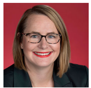
Senator the Hon Nita Green Assistant Minister for Pacific Island Affairs