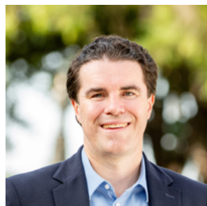
The Hon Tim Watts MP Special Envoy for Indian Ocean Affairs