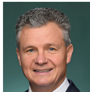
The Hon Matt Thistlethwaite MP Assistant Minister for Foreign Affairs and Trade