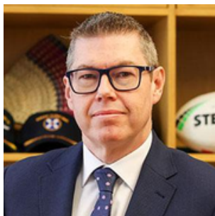
The Hon Pat Conroy MP Minister for Pacific Island Affairs