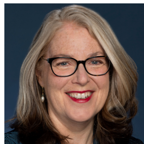
Jan Adams AO PSM Secretary of The Department of Foreign Affairs and Trade