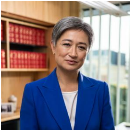
Senator the Hon Penny Wong Minister for Foreign Affairs

For business, the Budget signals that Southeast Asia, India and the Pacific will remain central to Australia’s long-term economic and geopolitical strategy. This creates opportunities for organisations operating across infrastructure, energy, logistics, education, resources, food security, healthcare, digital economy, critical minerals and strategic supply chains.